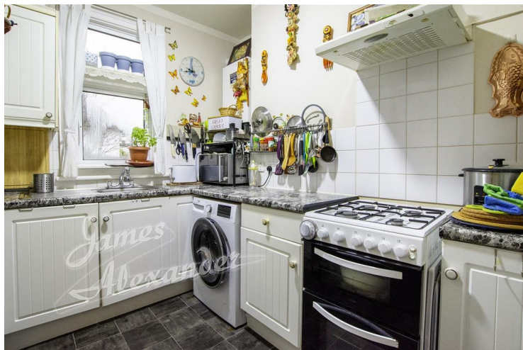
Kitchen 8'10" x 7'10" (2.7 x 2.4)