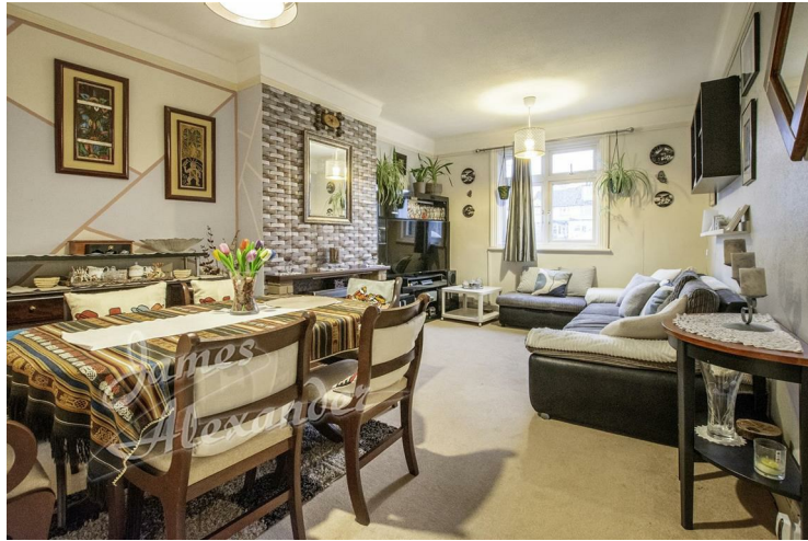
Reception 18'8" x 11'5" (5.70 x 3.5)