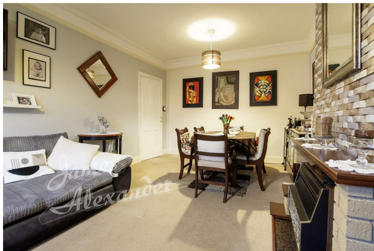
Reception alternative perspective