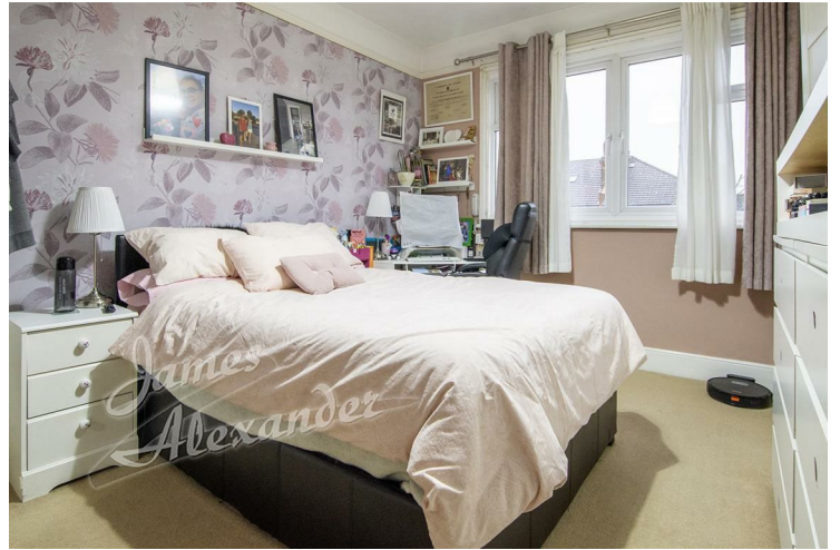
Bedroom 1 13'5" x 11'5" (4.1 x 3.5)